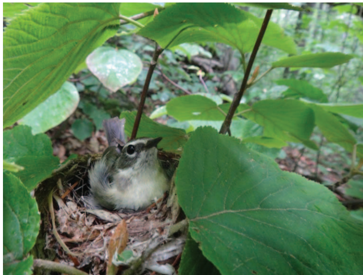
Top, male black-throated blue warbler ( Setophaga caerulescens ). Bottom, female black-throated blue warbler ( S. caerulescens ).